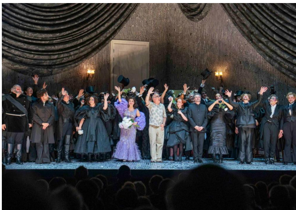
Final curtain call at the premiere of Il viaggio a Reims at the Haus für Mozart. The new production by Barrie Kosky was the centrepiece of the 2026 Salzburg Whitsun Festival.

(SF, 25 May 2026) “Bon Voyage!” was the motto of the 2026 Salzburg Whitsun Festival, which ends today, having won euphoric audience reactions and filled 99 percent of available seats.