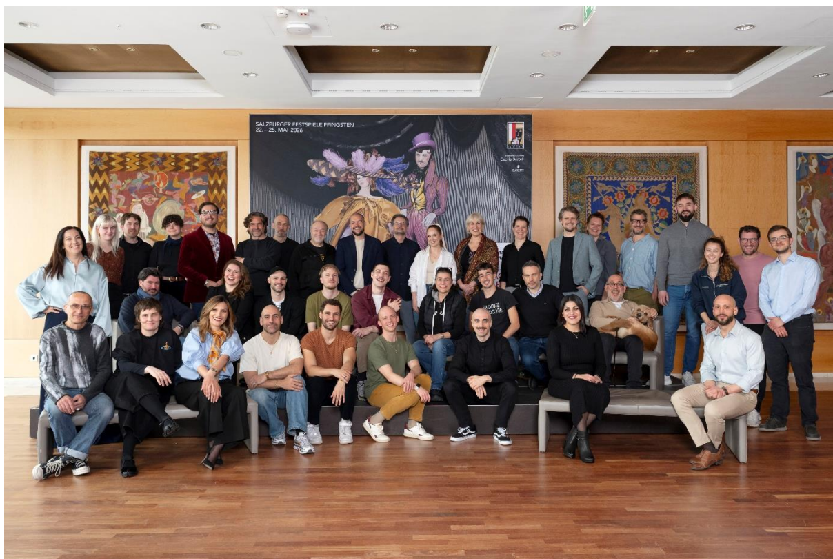
Artistic Director Cecilia Bartoli with the creative team and ensemble for the production Il viaggio a Reims. The premiere takes place on the Whitsun weekend on 22 May.

(SF, 20 April 2026) Cecilia Bartoli in the thick of things and on all stages: she is rehearsing for the gala evening “Ciao, bella ciao”, a journey through time and her musical cosmos. The first rehearsal week for Gioachino Rossini’s opera buffa Il viaggio a Reims , a new production of the Salzburg Whitsun Festival, has also just begun.