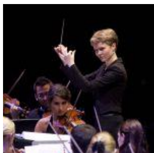
Mirga Gražinytė-Tyla WINNER 2012, LITHUANIA CHIEF GUEST CONDUCTOR OF THE CITY OF BIRMINGHAM SYMPHONY ORCHESTRA