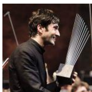
David Afkham WINNER 2010, GERMANY CHIEF CONDUCTOR OF THE ORQUESTRA Y CORO NACIONAL DE ESPAÑA