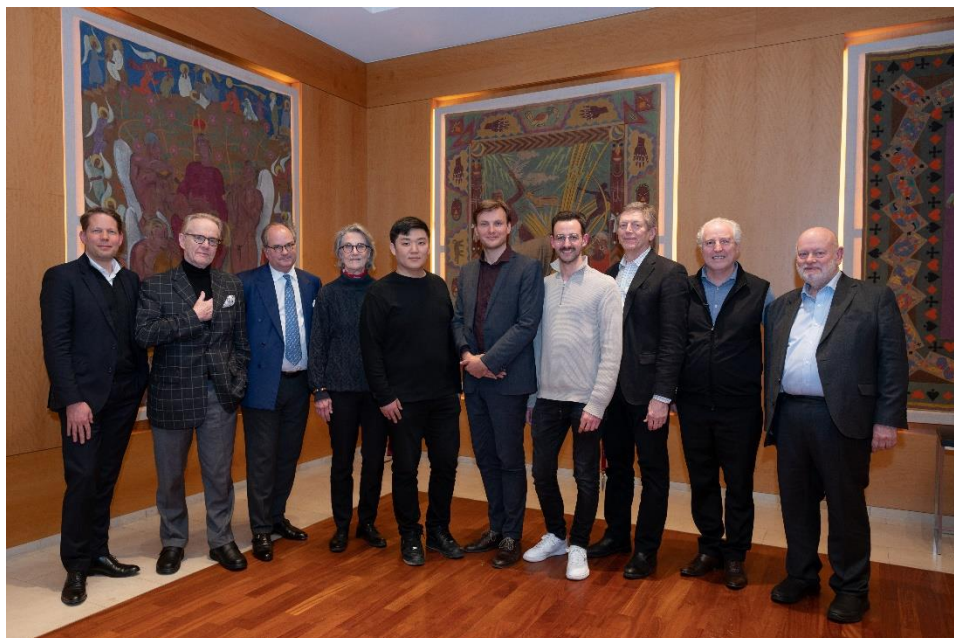
The three finalists of the 2023 Herbert von Karajan Young Conductors Award with YCA jury members