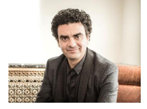
Rolando Villazón