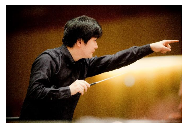
Kazuki Yamada © Marco Borggreve