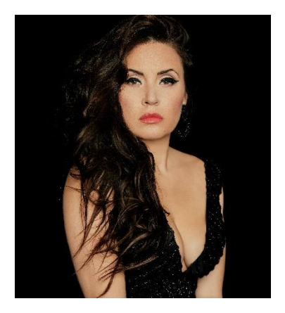
Sonya Yoncheva