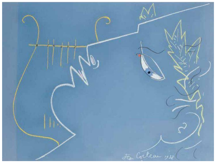
Jean Cocteau, Youth and Lyre, 1958