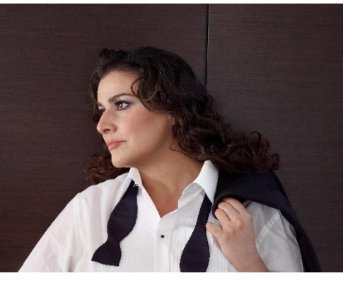
Cecilia Bartoli