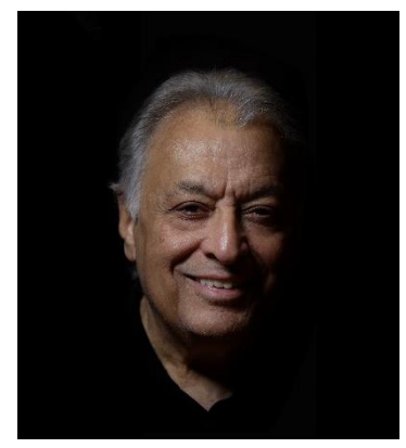
Zubin Mehta