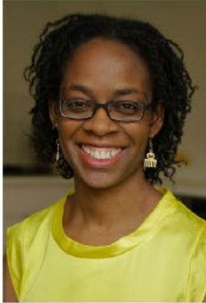
Sharon Dodua Otoo