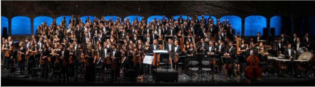
Gustav Mahler Jugendorchester