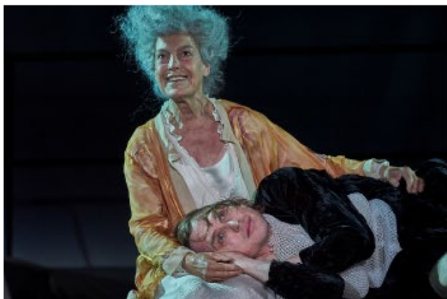
Angela Winkler