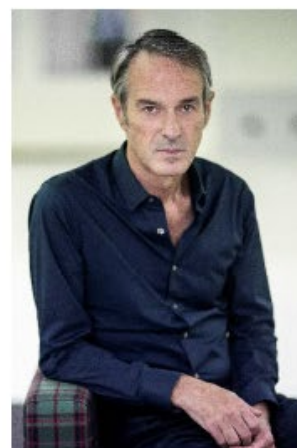
Ivo van Hove