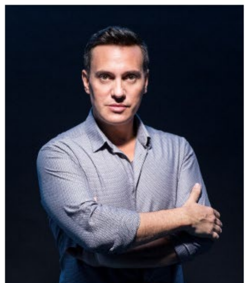
Erwin Schrott