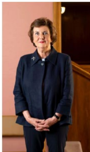
Helga Rabl-Stadler Präsidentin