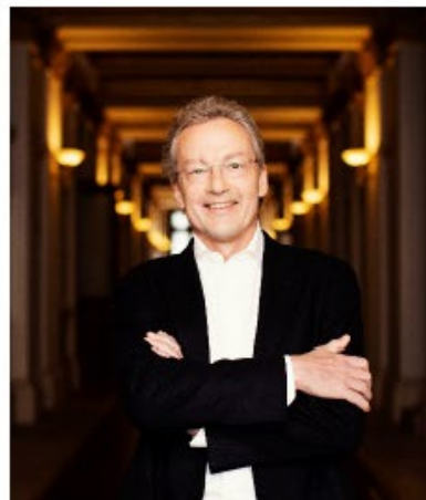
Franz Welser-Möst