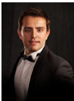
Alexey Neklyudov © 7NUKE