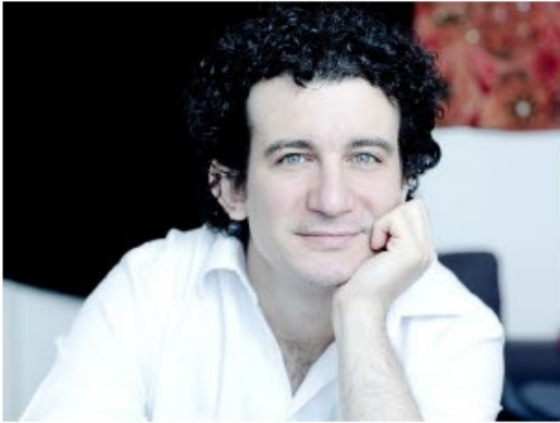
Alain Altinoglu