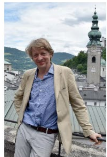
Michael Sturminger