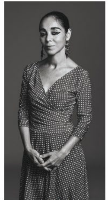
Shirin Neshat