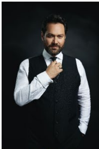
Ildar Abdrazakov