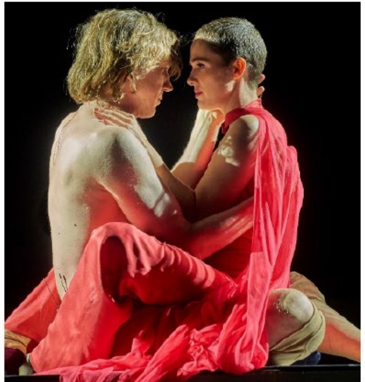
Lars Eidinger, Verena Altenberger