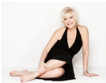
Karita Mattila