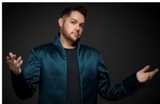
Rocha Edgardo