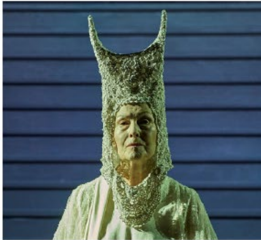
Edith Clever