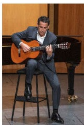
Juan Diego Flórez