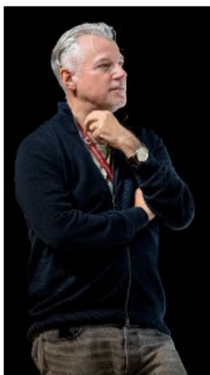
Christof Loy