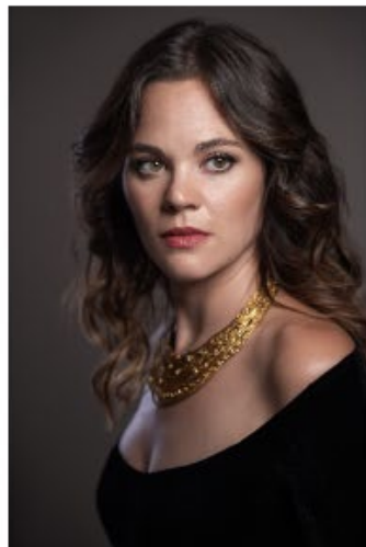
Regula Mühlemann