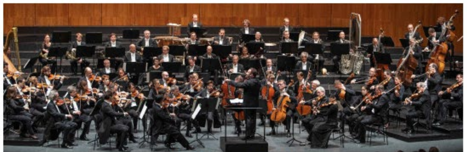
Berliner Philharmoniker, Kirill Petrenko