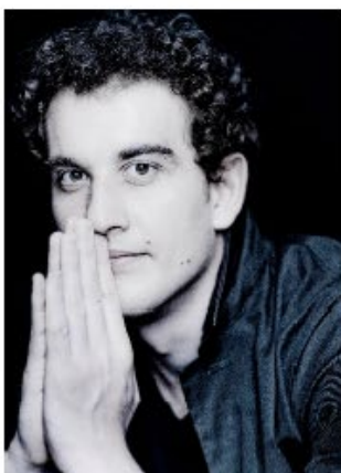
Tareq Nazmi © Marco Borggreve