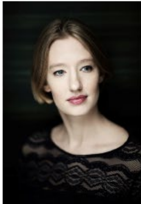
Joana Mallwitz