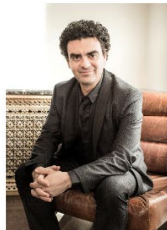
Rolando Villazón