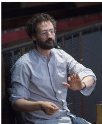
Gianluca Capuano