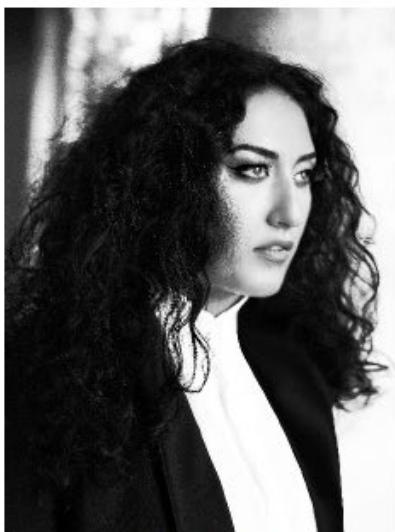
Anita Rachvelishvili