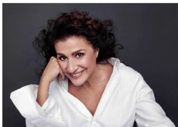
Cecilia Bartoli